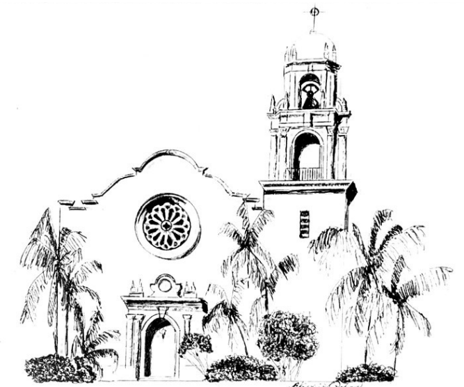
Christ Episcopal Church (Bradenton, Florida)

May the rain fall soft upon your fields And until we meet again May God hold you In the hollow of His hand