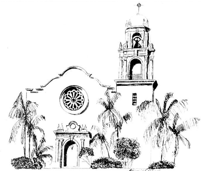
Christ Episcopal Church (Bradenton, Florida)